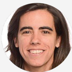
Isabel Benjumea Member of the European Parliament