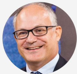
Roberto Gualtieri Former Italian Minister of Economy and Finance