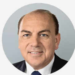
Axel A. Weber Chairman of the Board of UBS Group